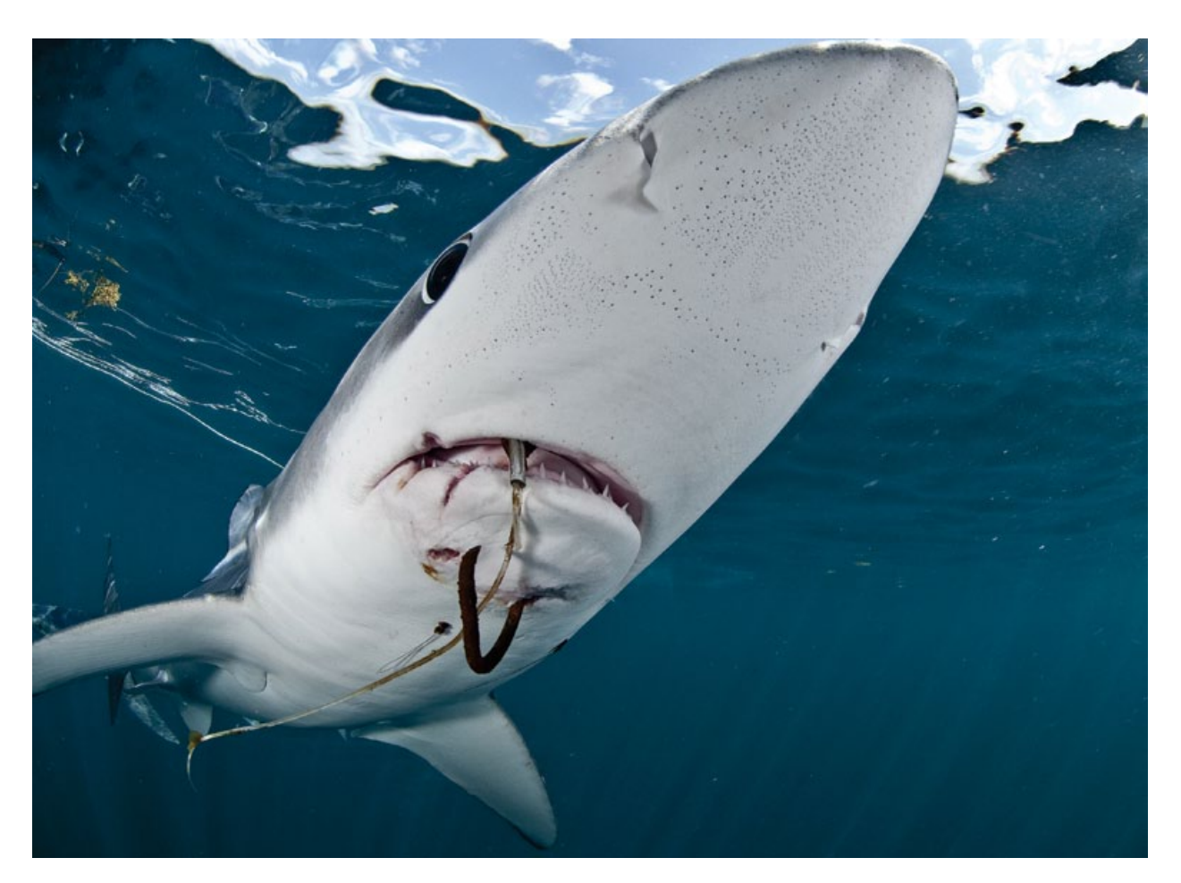
Sharks are usually unable to bite through wire leaders but have the potential to 'self-release' from monofilament leaders under some circumstances (image: Terry Goss Photography USA, Marine Photobank).