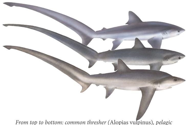
thresher (A. pelagicus), and bigeye thresher (A. superciliosus) (illustrations: Les Hata).