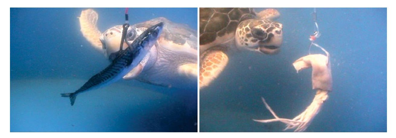
Sea turtles can bite off small pieces of finfish bait and thus avoid becoming hooked but they tend to swallow squid bait whole and ingest the hook as well (image source: NOAA Fisheries, Southeast Fisheries Science Centre).

The analysis is expected to be similar to the shark mitigation analysis presented by SPC at the recent WCPFC Scientific Committee meeting (Harley et al. 2015). This analysis investigated the theoretical effectiveness of the new shark CMM 2014-05 in reducing mortality to overfished oceanic whitetip and silky sharks. Specifically, the analysis showed that if all fleets banned wire leaders, or if all fleets banned shark lines, the estimated mortality reduction from the current baseline would be between 15-25% for both species. If all fleets banned both wire leaders and shark lines, mortality would be reduced by 30-40%. Further work will be undertaken to explore how these estimates would change depending on which fleets choose to ban which gear - a choice provided for under CMM 2014-05. These types of analyses, which we hope to produce at the sea turtle workshops, provide essential input for managers' decision-making on bycatch mitigation.