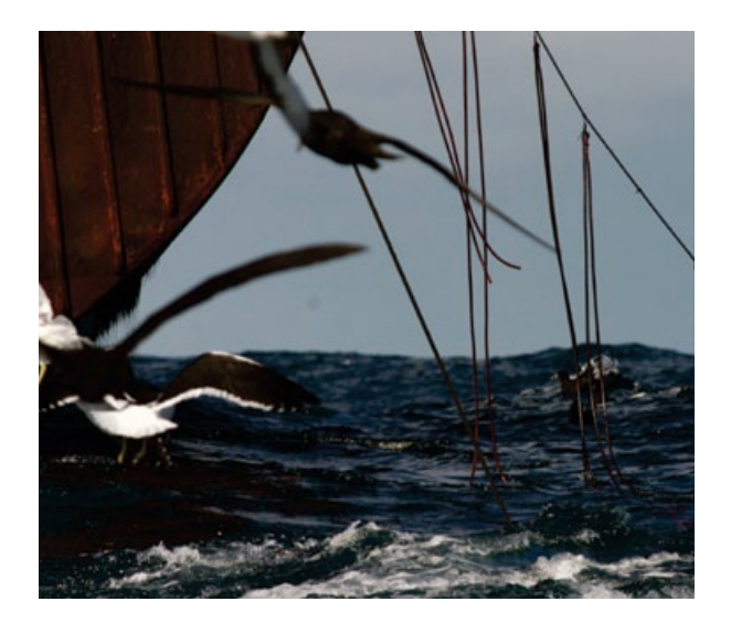
Tori (streamer) lines scare seabirds away from baited hooks as they enter the water, reducing bait loss and seabird hooking

Bycatch mitigation refers to actions taken to lessen the impacts of fishing activities on non-target organisms. In tuna fisheries, mitigation has taken the form of tori (streamer) lines aimed at reducing seabird hooking rates, regulations on leader material aimed at reducing shark catches, and restrictions on types of hooks and bait aimed at reducing sea turtle interactions. How well do these mitigation measures work in practice, and are the mortality rates now low enough to allow bycatch populations to be sustained? Unfortunately, these questions remain largely unanswered in tuna fisheries. While it may feel good to adopt mitigation measures, it is not