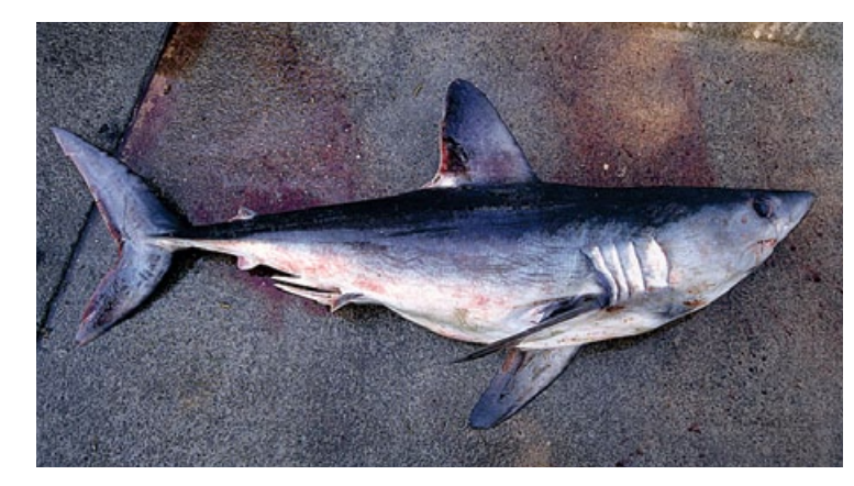
The ABNJ (Common Oceans) Tuna Project is coordinating the first global shark stock status assessment for the southern hemisphere population of porbeagle shark (Lamna nasus).

Plans for a second pan-Pacific assessment are emerging after the WCPFC Scientific Committee noted its interest in a pan-Pacific assessment of thresher sharks based on consideration of trends and vulnerability. Like porbeagle, the bigeye, common and pelagic thresher sharks are listed as WCPFC key sharks (as 'threshers'), but analysis has thus far been constrained by data quantity and quality (Rice et al. 2015). In the case of threshers, many catches are not recorded to species, so preliminary work on species separation will be necessary. Recent studies of thresher catches in the Eastern Pacific indicate that common (Alopias vulpinus) and pelagic (A. pelagicus) threshers dominate, but in the Western and Central Pacific bigeye threshers (A. superciliosus) appear to be the most abundant thresher species, particularly in the waters off Hawaii (Clarke et al. 2011, Rice et al. 2015). The thresher species complex as a whole shows low productivity and high susceptibility to longline fishing