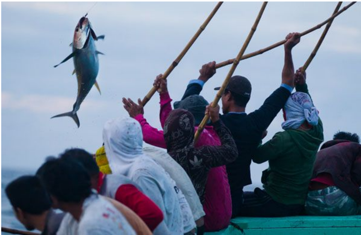
Indonesian one-by-one tuna fishing

16th Regular Session of the Western & Central Pacific Fisheries Commission Port Moresby, Papua New Guinea, 5-11 December 2019