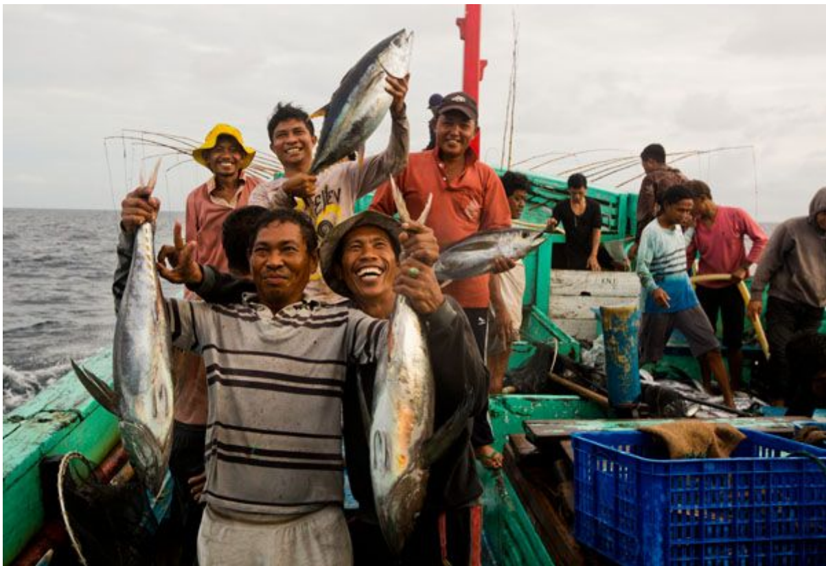
Happy fishers and their catch

There are several proposals on the table for this year's Regular Session which will advance these key issues, and we hope common ground can be found. Progress across all of these areas is needed, as more sustainable management frameworks will benefit every CCM, bring positive long-term returns to fishing communities, and minimise the risk of future fisheries collapse. We look forward to working with delegates as well as with our Members to strive for the highest standards of sustainability and equity in fisheries management to reinforce the good work of the Commission.