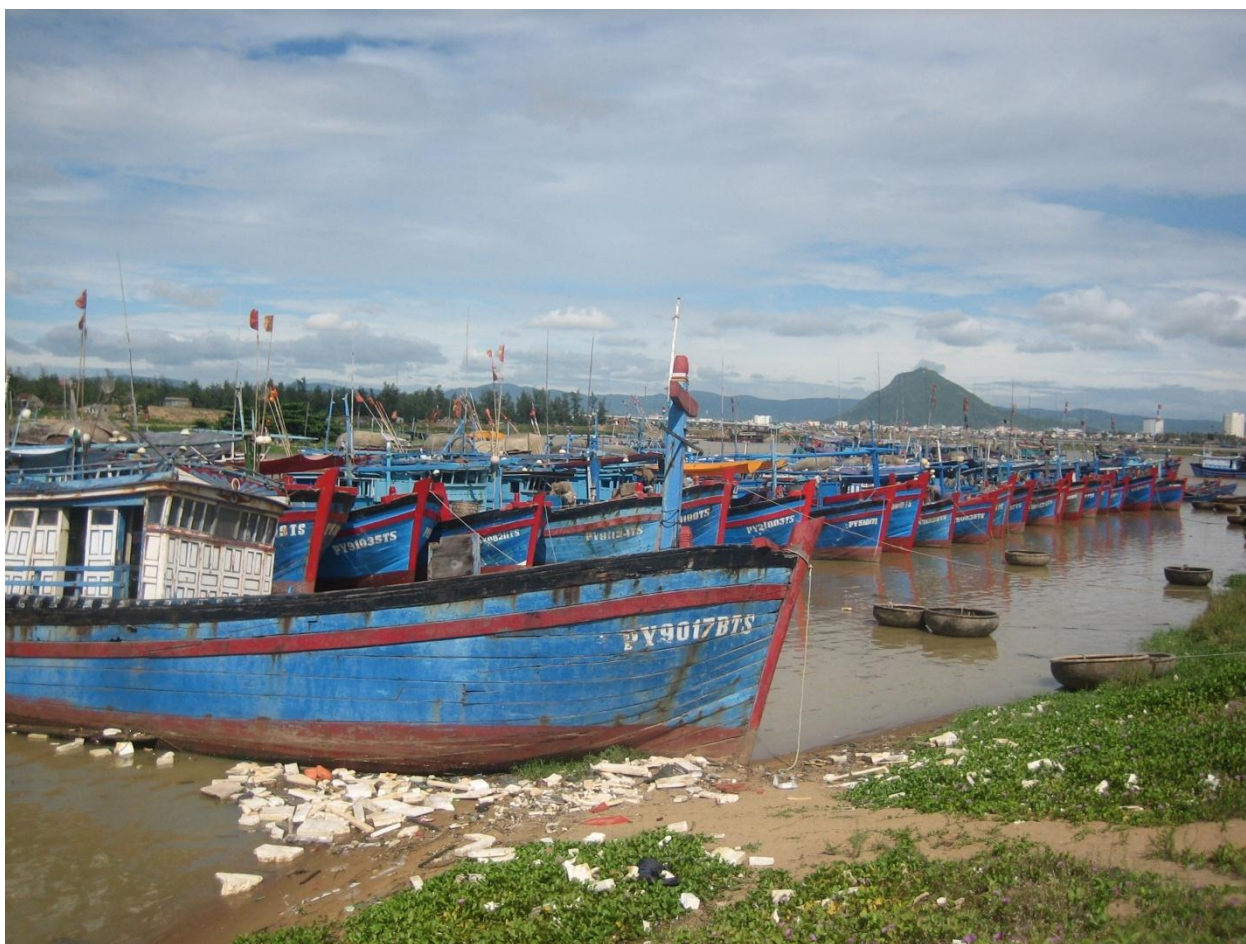
Tuna fishing vessels at Dong Tac landing site, Phu Yen province.

According to Article 2 of this: “ VINATUNA is a socio-professional organization and act by regulations which were stipulated by Minister of the Ministry of Internal Affairs in compliances with legislations of the Vietnamese Government. The association is directly managed by Ministry of Agriculture and Rural Development and other Government management. VINATUNA is legality, self-responsibility, self-financing and has an independent bank account ”