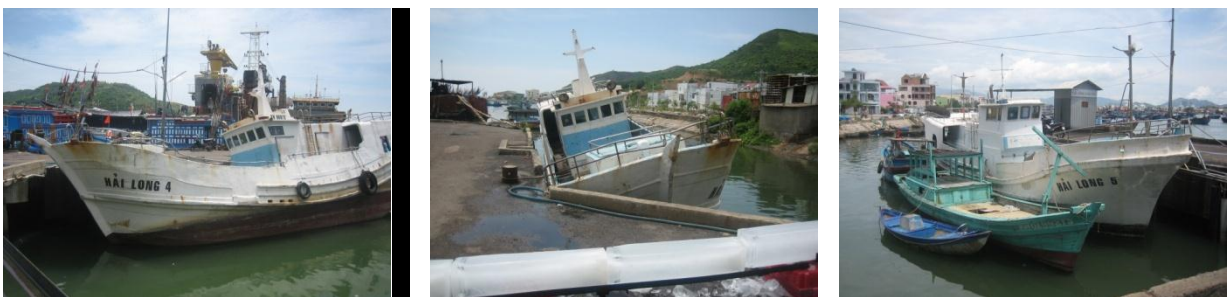
Oceanic tuna longliners of a tuna fishing industry are stationary at Hon Ro port, Nha Trang city, Khanh Hoa province since no effective operations.

The value chain of the tuna product can be included as follows: scientific research activities to predict fishing grounds, management services for post-harvest product quality, fishing port services, fishing vessel, fishing technologies, post-harvest technologies, ice water quality, coolers, middleman, tuna product business, product promotion, exporting, emergency services, etc. In other word, we need to establish a comprehensive and synchronous system among logistic services, infrastructures and fishery management system to support for fishing operations. It is very difficult to establish such systems without cooperation between government and private sectors. Although one fishing agency can have enough above mentioned factors, it should not still provide the promises whether their business activities can be successful or not if they do not have cooperation among other relevant stakeholders. Even though a fishing company might have enough financial resources, the markets and/or fishing technologies, it does not mean that the company can meet its business purposes and can come over economic crises.