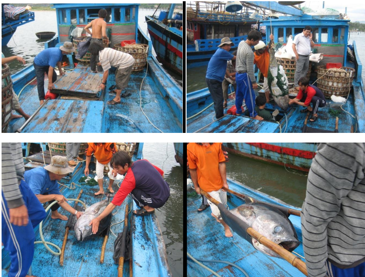
Unloading, transferring and preservation methods of the fishers in the central provinces (The pictures were taken by author at Tam Quan, Hoai Nhon, Binh Dinh in September 2011).

Tunas are unloaded and transferred one by one whenever the vessel arrive the landing site. Fish under the coolers are pulled over using the winches. Immediately sea water is used to clean blood and other waste materials. And then fishes are transferred to a clean place for pre-processing. The fishes are gilled, gutted and loaded into the trunks for transportation.