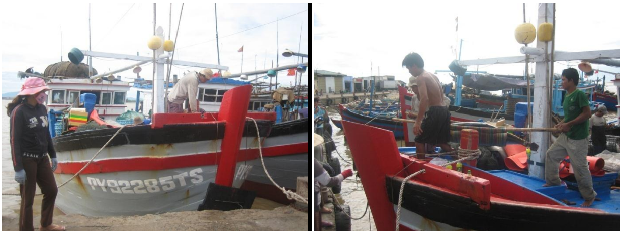
Tuna longliners at Phuong 6 fishing port, Phu Yen province.

The tuna fishing vessels are usually made by wood with traditional designed styles and the capacity range from 90 to 400 horse power. These fishing vessels are normally equipped Global Position System (GPS), sonar, low and high frequency telecommunication facilities, etc. Fishing gear configurations depend on size of the vessels. Normally with the longliners, each mainline has from 700 to 1000 hooks (1200 – 1400 hooks in Binh Dinh) with the length of mainline of from 40 – 80 km. The branch line length is from 30 – 35 m and the distances between the branch lines are around 60 m. The soaking time of each haul is around 3-4 hours and suitable fishing event varies from 14 – 15 p.m. and 01-02 a.m. During soaking time, the vessels must run around to check if there are any fishes to be hooked for immediate preservation to improve fish quality.