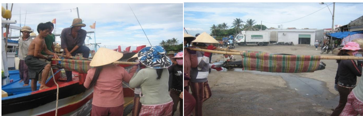
Transferring to the pre-processing place at Phuong 6, Phu Yen province.

Tunas are unloaded and transferred one by one whenever the vessel arrive the landing site. Fish under the coolers are pulled over using the winches. Immediately sea water is used to clean blood and other waste materials. And then fishes are transferred to a clean place for pre-processing. The fishes are gilled, gutted and loaded into the trunks for transportation.