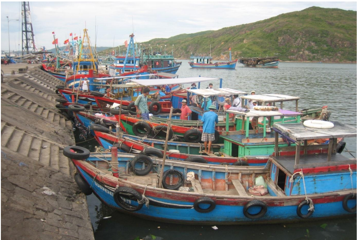
Fishing vessels at fishing port of Qui Nhon city, Binh Dinh province (The picture was taken by author).

One of the remarkable characteristics of fisheries in Vietnam is the small scale fisheries. Fishing communities are usually the poor fishers with limited financial resource for the fishing activities. They usually use traditional and backward fishing methods and thus, the advanced fishing technologies are seldom used. Therefore they are fishing individually without collaborating together.