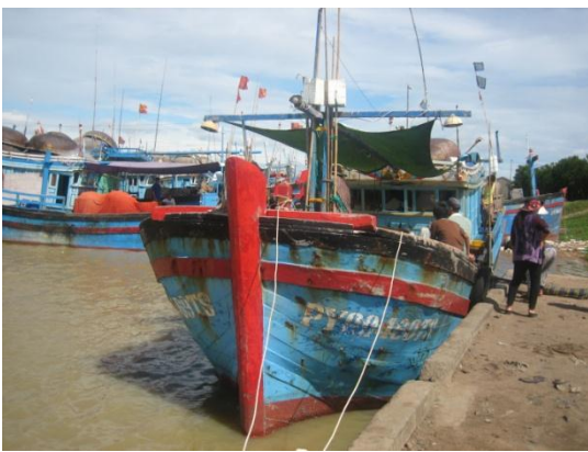
Tuna fishing vessel of Phu Yen province

Expanding the branches at districts, communes and villages is difficult as well and impossible to implement.