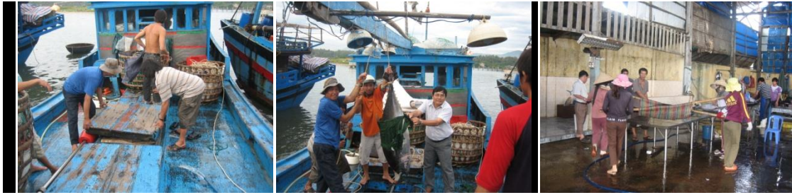
Harvesting activities and tuna product processing of fishing communities

Vietnam's Tuna Association concentrate on the national scale tasks such as the participation on strategy and plan development process and review of the legal and policy frameworks on tuna fishery management. The national association also advise the legal procedures to the fishing community. It also participate fisheries resources management activities to develop sustainable tuna fisheries. It represents the fishing communities and businessmen on participation of the activities organized by the international organizations and to establish sustainable and sincere international cooperation. The national association is also legal representative of fishing communities on resolving the conflicts about international trademark, trade and copyrights, discoveries and inventions. The association can be leading on tuna brand promotion process of Vietnam and organize the fairs, exhibitions and advertising for the Vietnam's tuna products. Once the functions and management tasks between the Government management agencies and local and national Tuna Associations are clearly assigned, the activities in tuna production and business will definitely develop strongly and effectively.