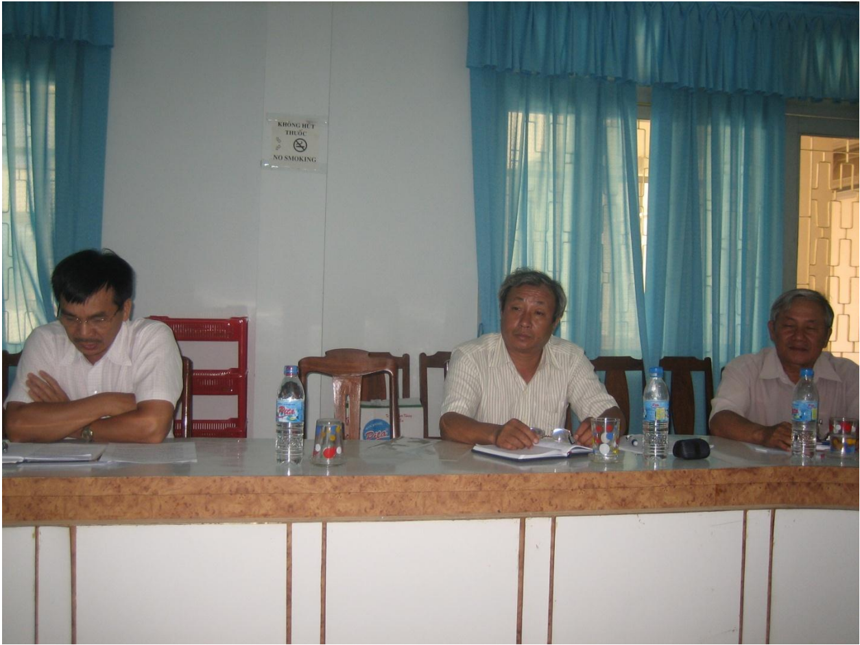
Standing committee of Tuna Association in Phu Yen

It can be seen that the steps to prepare the establishment Phu Yen Tuna Association and its inception meeting are very lawful. Government management agencies had strictly managed the association establishment process. The inception meeting has invited 69 members including 50 fishermen and owners, 9 businessmen and 10 government officials. On the meeting the association's regulations were approved including 8 chapters, 26 Articles. The meeting also elected Executive Committee consists of 19 people, of those: