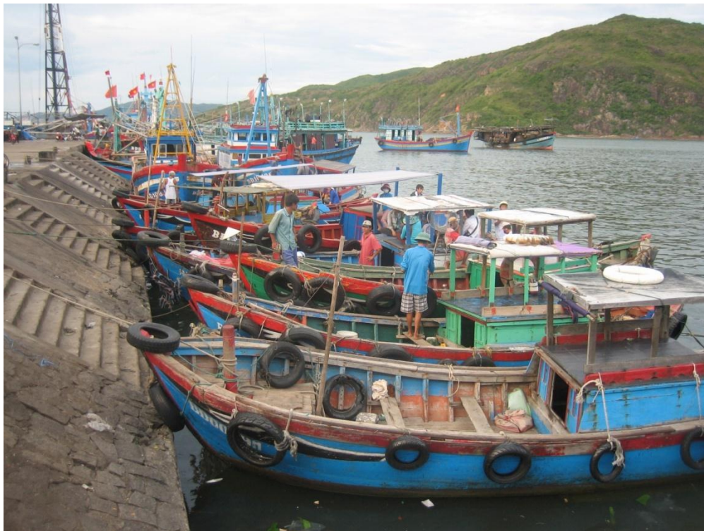
Tuna vessel lining at Quy Nhon, Binh Dinh

For tuna fisheries continuing to develop effectively and meet the expectations in the above development strategies, it is necessary to strengthen the roles of state management together with building legal framework systems to better manage tuna fisheries. It is also necessary to consolidate and improve the management roles of the community so that they can have conditions and chances for self-management. They will feel more responsible on fishing operations to protect their fisheries resources for future generations. In this whole process, the roles of the management organizations such as the Tuna Association are extremely important.