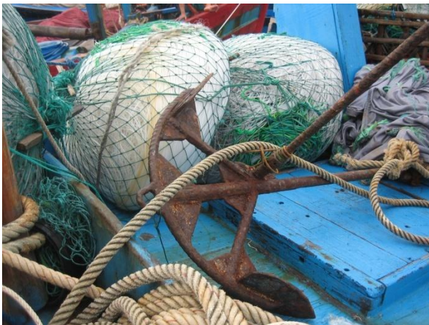
Fishing gear of tuna longline vessel

+ The association is not well-organized and unidentified what are the association's management contents and what are the links among other clues in the value chain of tuna products. The strategies about management, economy and finance of the associations have not been planned in the annual work plan of the Associations.