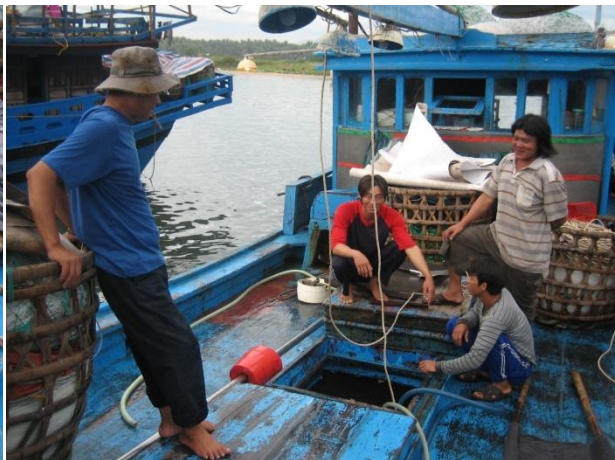
Fishermen after a fishing trip