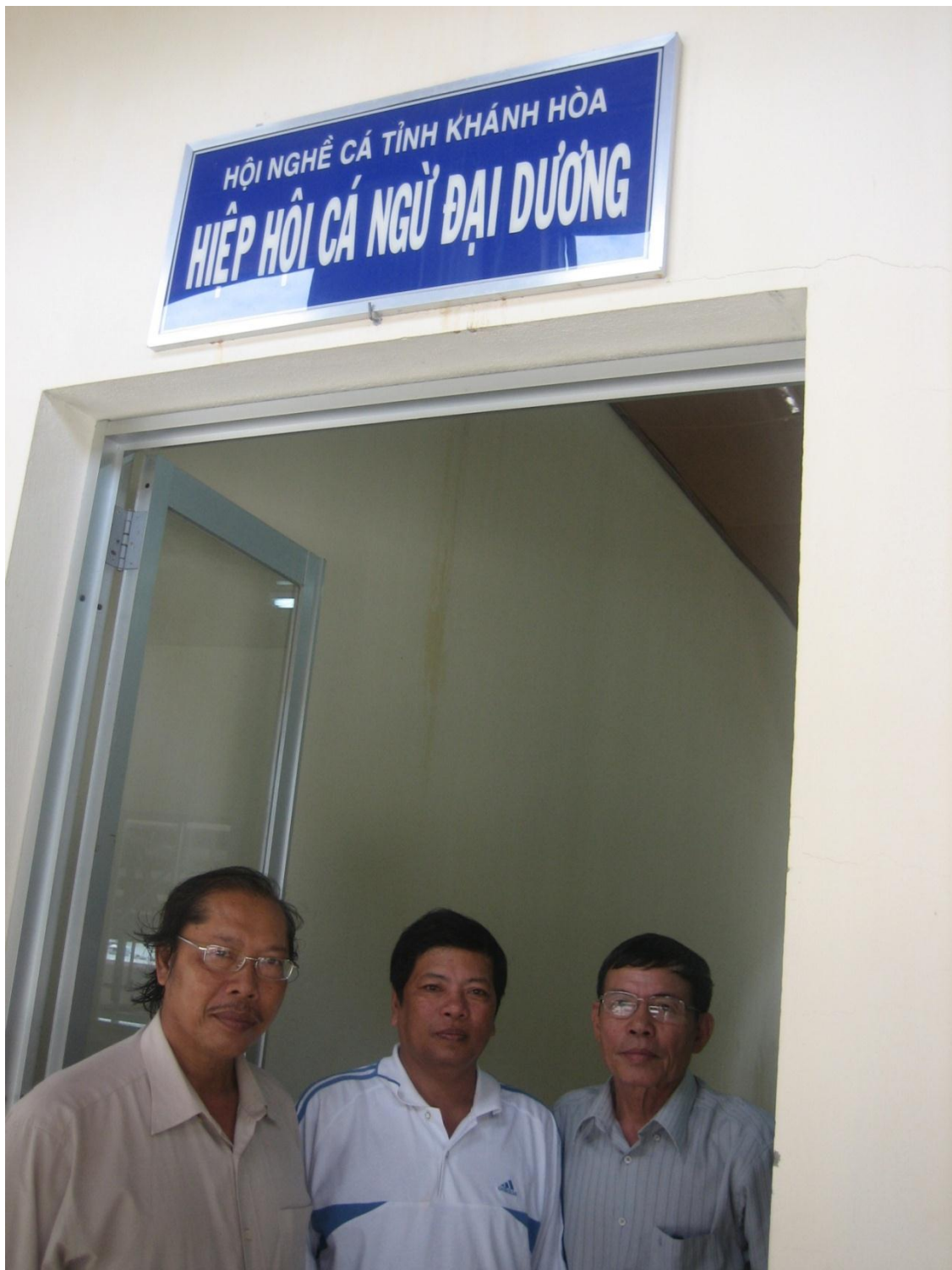
Chairman and members in the executive board of the association

Although it is indicated in the regulations that the association has an independent office, its office must be shared with Hon Ro fishing port authority and located at Hon Ro fishing port instead of the address regulated in the regulations.