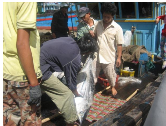
Unloading activity of Phu Yen fishers

Though those difficult conditions, recently Phu Yen has successfully created Phu Yen's tuna brand (PHU YEN TUNA) and registered at the Intellectual Property Department and Vinh Sam Company owned by the vice Chairman of the Association has set up the combined activity chains consisting of manufacturing, processing and exporting tuna products. This is one of the most significant activities of the Association in the development of oceanic tuna fisheries.