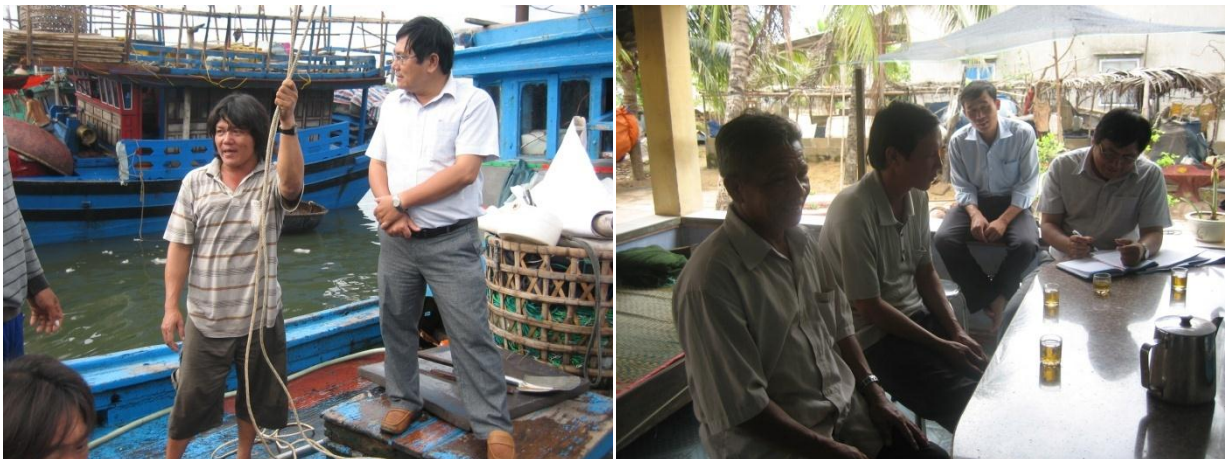
Interviewing fishing vessel captains in Binh Dinh province (at Tan Thanh village in the left and at Tam Quan village in the right picture). The pictures were taken by author in September 2011.

In Phu Yen province, oceanic tuna fisheries have made the positive changes of lives of hundred local fishers' families. The lives of a hundred families have been improved and some of them have become the rich fishers. In 2011, there are approximate 700 oceanic tuna longliners in Phu Yen province and annual tuna catches reached around 5,200 tons with the value of 700 billion VND (2.5 million USD). Almost the fishers working on the tuna longliners gained relative high profits and averaged approximate 10 million VND per trip (Phu Yen Knowledge Journal, 2011).