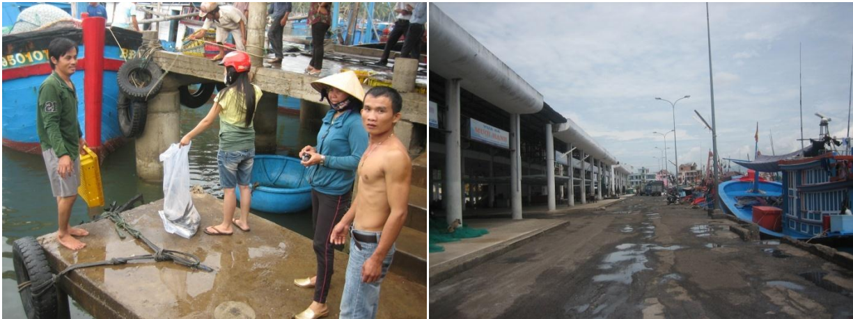
Business activities of tuna fisheries outside legal landing site (The left hand side is at Tam Quan, Binh Dinh and the right one is at Hon Ro fishing port, Nha Trang).

ers fishing at sea, they have never exchanged information each other such as informing the good fishing grounds and markets. There are also no clear contracts between the fishers with processing companies and middle men that the landings must be sold for a specific buyer. This is also causing difficulties on landing data collection and management.