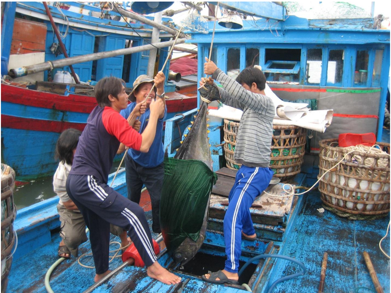
Unloading activities at Tam Quan, Binh Dinh (The picture was taken by the author in September 2011).

In addition, due to very high benefits gained from the oceanic tuna fisheries, many fishing companies and individual fishers invested their budget source to build the new tuna fishing vessels and other necessary fishing facilities. Such the typical examples were Dai Duong Company, Viet Tan Company and Bien Dong Marine Capture and Service Company located at Ho Chi Minh City and Manh Ha Company based at Ba Ria – Vung Tau province. In total, these companies invested to buy about 40 newly built tuna longline vessels with capacity from 150 – 500 horse power. These tuna fishing vessels were normally imported from Japan. Together with development on tuna longline fishery, other tuna fishing technologies were also introduced and expanded by fishing communities at central provinces of Vietnam (Binh Dinh, Phu Yen and Khanh Hoa) (i.e. gillnet and purse seine fisheries).