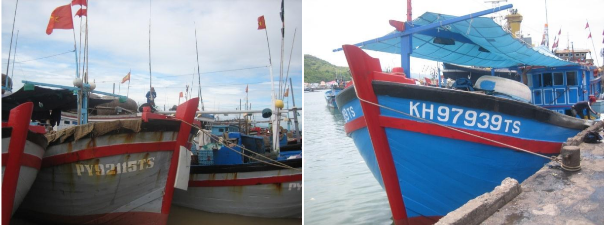
Offshore fishing vessels of Phu Yen and Khanh Hoa provinces (The pictures were taken by author).

the inshore areas. Since the above decision implemented, 1382 fishing vessels have been newly built or transformed from the fishing vessels into the logistic vessels. In addition, the fishers have also self-financed to build other new 5000 fishing vessels to compensate for the offshore fishing fleets contributing for approximately 7000 units including oceanic tuna fishing vessels.