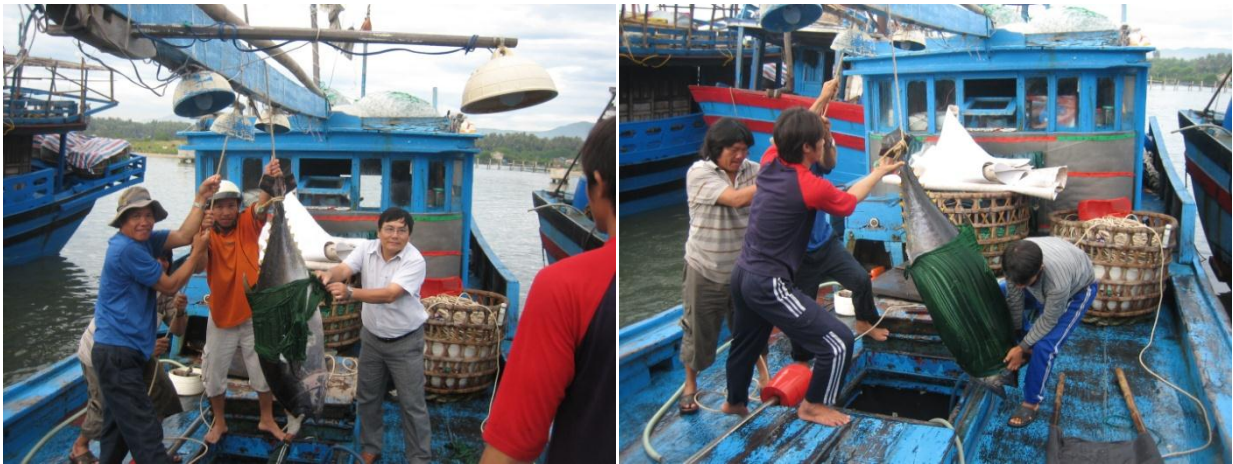
Unloading activities of oceanic tuna vessels at Tam Quan, Binh Dinh.

In addition, according to information from buyers, the total potential estimation value of oceanic tuna catch of Vietnam can reach about 500 million USD per year. If so, this can be a significant figure for Vietnam's fisheries sector in general and the tuna fisheries in particular. However, the annual real value obtained from tuna fisheries was only around 100 million USD (only about 20% compared to total potential estimation value). One of the problems with current tuna fisheries of Vietnam is that small tuna vessels using traditional fishing methods and gears with low capacity can fish more effectively than the big one with high capacity and equipped advanced fishing technologies. Therefore, the number of tuna fishery vessels (40 units) which were invested by fishing companies or fishers was only operated at the early years since the tuna fisheries introduced to Vietnam (1990s). Currently, these vessels cannot continue fishing since efficiency and benefit obtained from these vessels is low. As a result, these vessels must be stationary and not go for fishing at all.