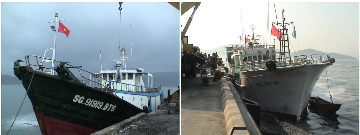
The first tuna longline vessels of Vietnam (Western Stone Vessel and SG.91919.BTS on the right and left hand side, respectively).

After each fishing trip the fishers usually sell entire their landing to buy rice, food and other necessary goods to maintain their lives and the remaining budget portion used for next fishing trips. Therefore, if national economy has problem then the fisheries may be influenced as they are also impacted by market economic rules. In recent years, Vietnamese fisheries have been changing very fast together with development of national economy. The fishing methods and gears have been always upgraded and improved to target on high value commercial species for exporting to achieve higher benefit. Oceanic tuna fisheries are also the case. Oceanic tuna fisheries of Vietnam introduced by Japanese in the period from 1988 - 1989 throughout South-Western Fisheries Product Processing and Logistic Service Company (the former name of Bien Dong Marine Capture and Service Company) and until now the tuna fisheries have still producing significant incomes for local fishing communities.