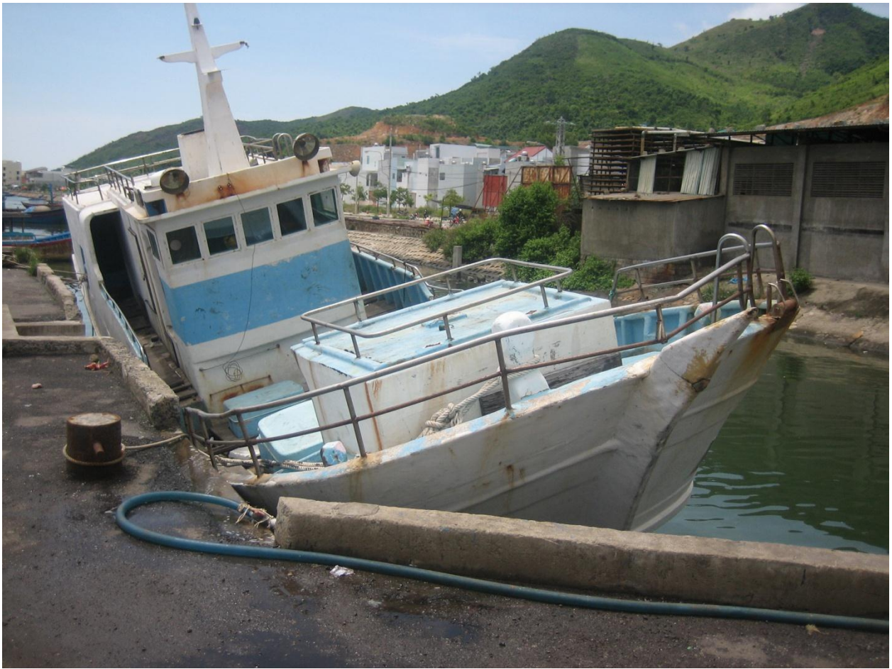
The oceanic tuna longliner of a fishing company at Hon Ro, Nha Trang city, Khanh Hoa province (The picture was taken by author in September 2011).

In the early 1990s, with expectations of offshore fisheries development, Vietnamese Government proposed and established a program called “ Motivation Program – Doi Moi ”. At the same time, new fishing technologies were introduced into Vietnam and this also encouraged development of oceanic tuna fisheries. However, this program seemed to fail to fulfil its expected outcomes and one of its limitations was that there was no possibility to change small scale tuna fisheries using traditional fishing methods into the large scale commercial fisheries.