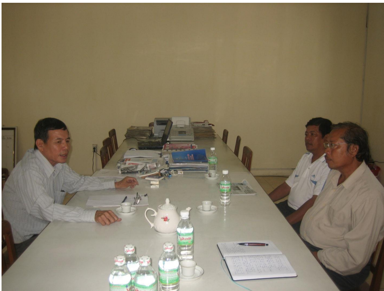
The office of Tuna Association of Khanh Hoa province