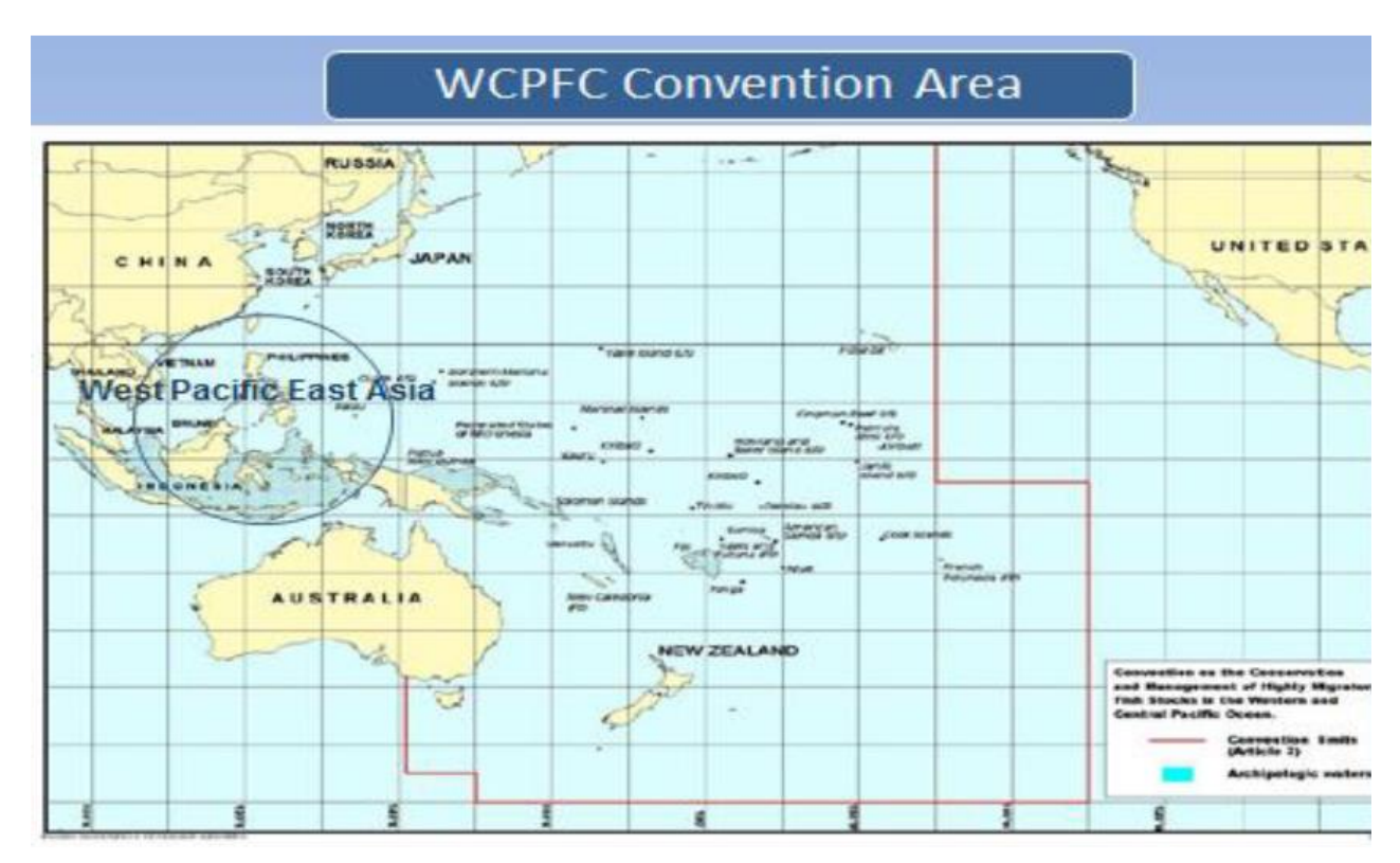
Exhibit 3: WCPFC Convention area including East Asian Seas<sup>3</sup>

For the Exclusive Economic Zones (EEZs) of Indonesia, Philippines and Vietnam, connected with the POWP LME, the oceanic tuna catch<sup>4</sup> in 2012 was estimated at 632,000 metric tons, approximately 14 per cent of the global tuna catch and thus considered of global and regional significance. This comprises around 25% of the catch of skipjack, yellowfin and bigeye tuna in the Western and Central Pacific Ocean (WCPO), with significant catches of coastal tuna and associated species as well. Indonesia takes nearly 70% of that oceanic tuna catch,<sup>5</sup> Philippines takes 20%, and the balance is caught by the more recently developed Vietnam fishery.