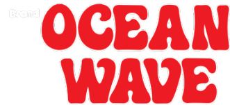
Ocean Wave by Thai Union