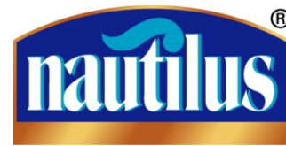
Nautilus by Pataya Foods