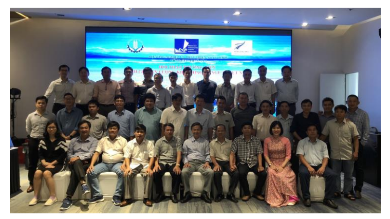
10<sup>th</sup> Vietnam Tuna Fishery Annual Catch Estimates Workshop (VTFACE-10)