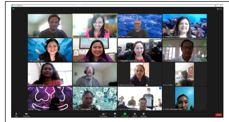
Introduction on the new NSAP Database System, Philippines via Zoom

These activities are expected to be completed in 2022.